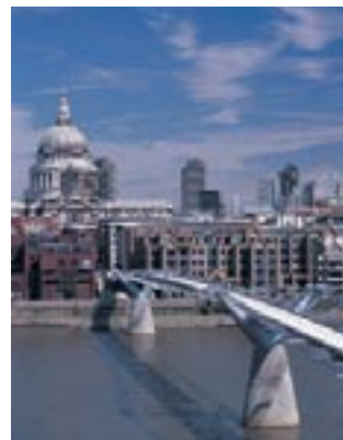
St Paul's Cathedral and the Millennium Bridge