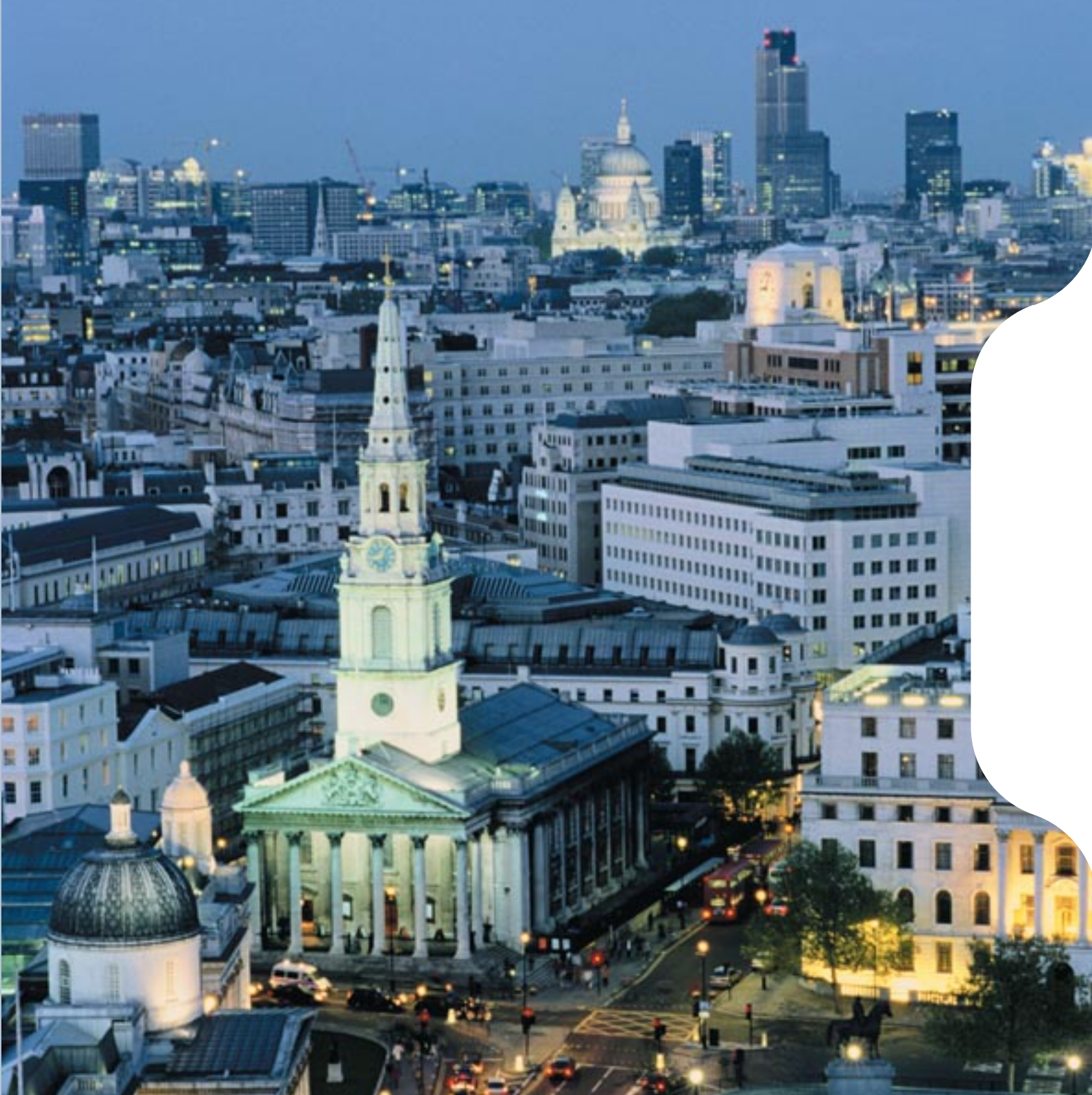
The City of London from Trafalgar Square